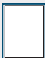
8.5 x 11 inches with .25 inch bleed