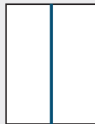
3.75 x 10 inches