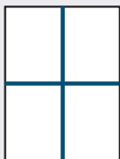
3.75 x 5 inches