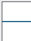
7.5 x 5 inches